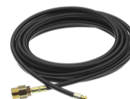
PIPE DRAIN KIT COD. 1272520