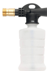
FOAM LANCE BOTTLE. COD. 40320