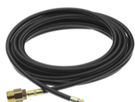
PIPE DRAIN KIT (16M) COD. 1272530