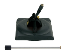
PATIO CLEANER PRO WITH PRESSURE ADJUSTMENT COD....