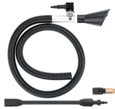
WATER SUCTION KIT 41592