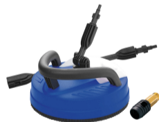
PATIO CLEANER Ø 30 CM WITH DETERGENT TANK COD. 41687