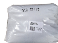
CALIBRATED AND FILTERED SAND (25 KG) 41770