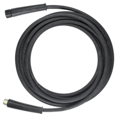
HOSE AP REINFORCED 8MT. COD. 3520550