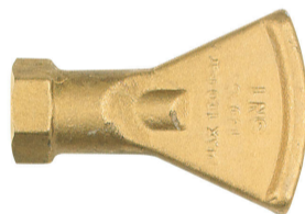
STEAM NOZZLE. COD.