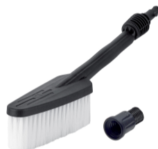
HIGH PRESSURE WASHER FIXED BRUSH 41577