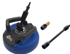
PATIO CLEANER Ø 30 CM 46359