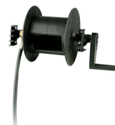
RLW WITHOUT HP HOSE 42660