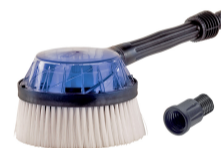
HIGH PRESSURE WASHER ROTARY BRUSH 41578