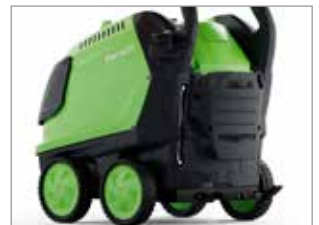
STURDY AND LARGE TANK AND ACCESSORIES STORAGE