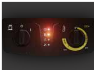
CONTROL PANEL WITH INDICATOR LAMPS