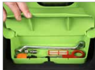
USER FRIENDLY ACCESS TO ADJUSTMENT